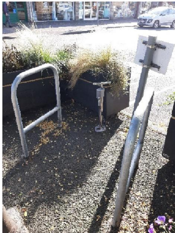
Two bike racks, bike pump station and planters