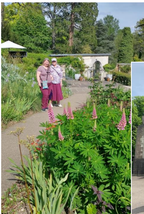
Stroud Museum & garden and Amberley Church